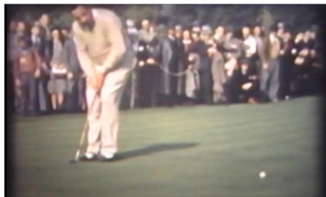
Walter Hagen putting at Cutten Fields 1940